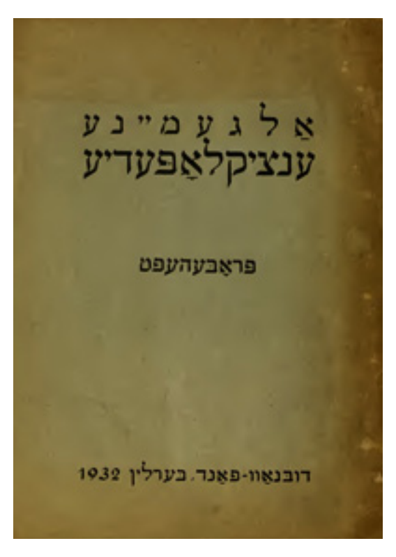
General Encyclopedia, Sample Volume, Dubnow Fund, Berlin 1932