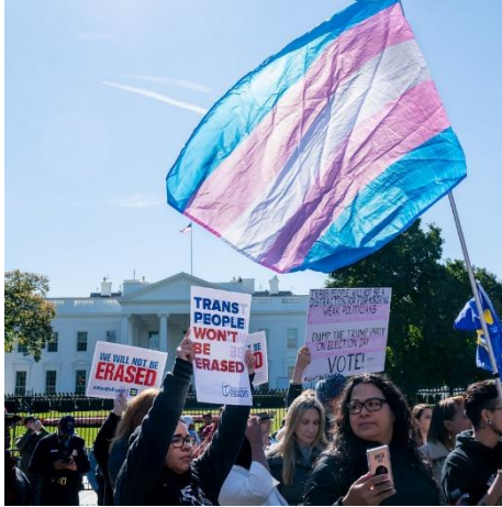
Transgender Health Care Rally by the White House, 22 nd October 2018

Trans Rights in the US are historically inconsistent, as laws on gender changing and anti-discrimination are passed on a state level and may be subject to change whenever a new government is in place. For instance, while the state of California only requires a court order to correct the gender on birth certificates and has no restrictions on amending passports and driver's licenses, Tennessee has actually outlawed the change of birth certificates. 9 Only as of June 2020 was protection against discrimination based on gender identity in the realm of employment, an area that markedly affects a person's livelihood, universally assured by the US Supreme Court. 10 While gender diversity is more visible than ever, open repudiation is just as prevalent, often based on a perceived violation of morals and tradition. 11